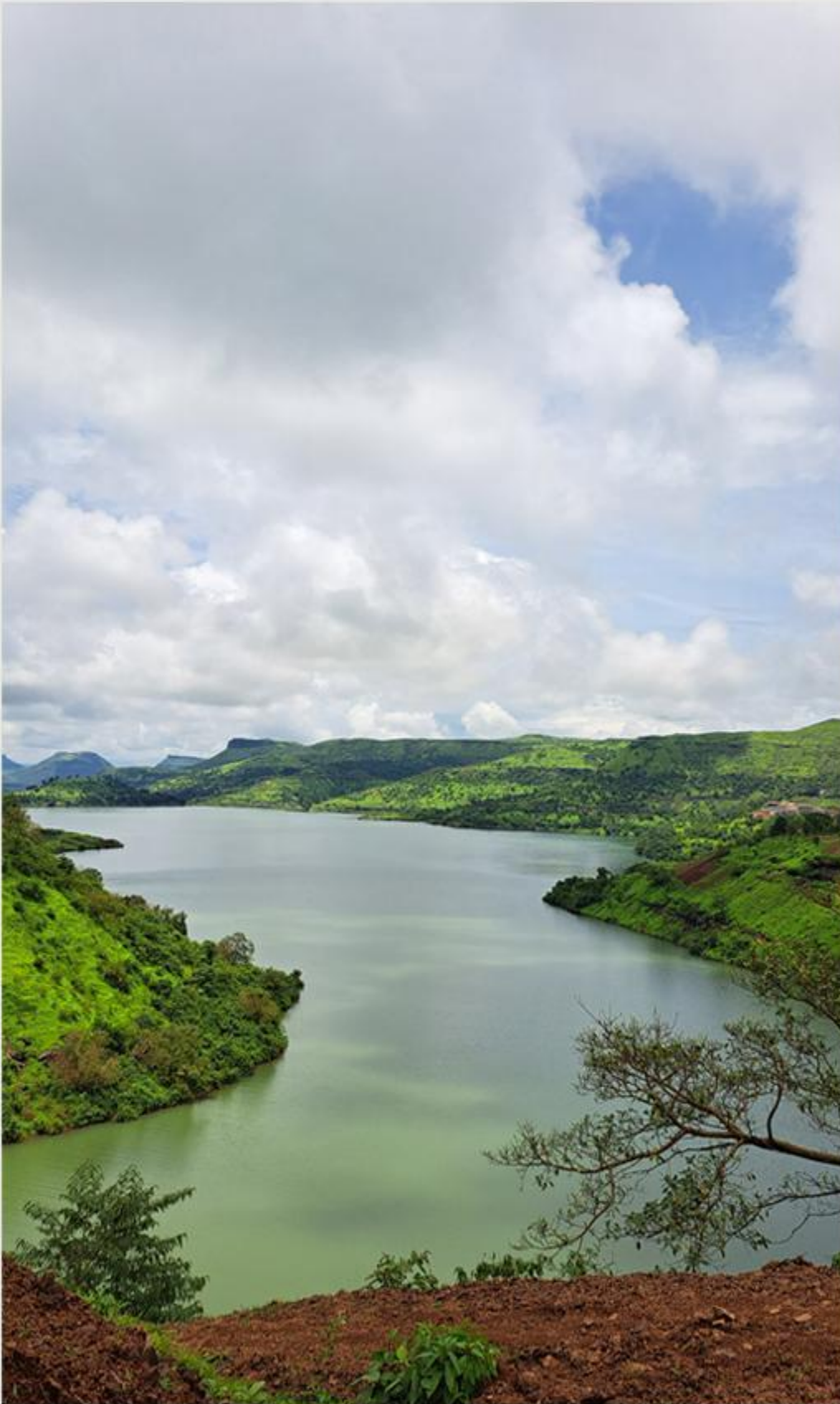
View from within the gated community premises. (few minutes walk)

The villa is set amidst some amazing landscapes. During rains & winters, you will be amazed with what nature can offer. We suggest you step out and explore the fog, the streams, valleys & waterfalls. During summers, enjoy soothing nights stargazing the clear skies. You can even visit Bhavli Dam, Kalsubai Peak & Ashoka waterfall which are in close proximity.